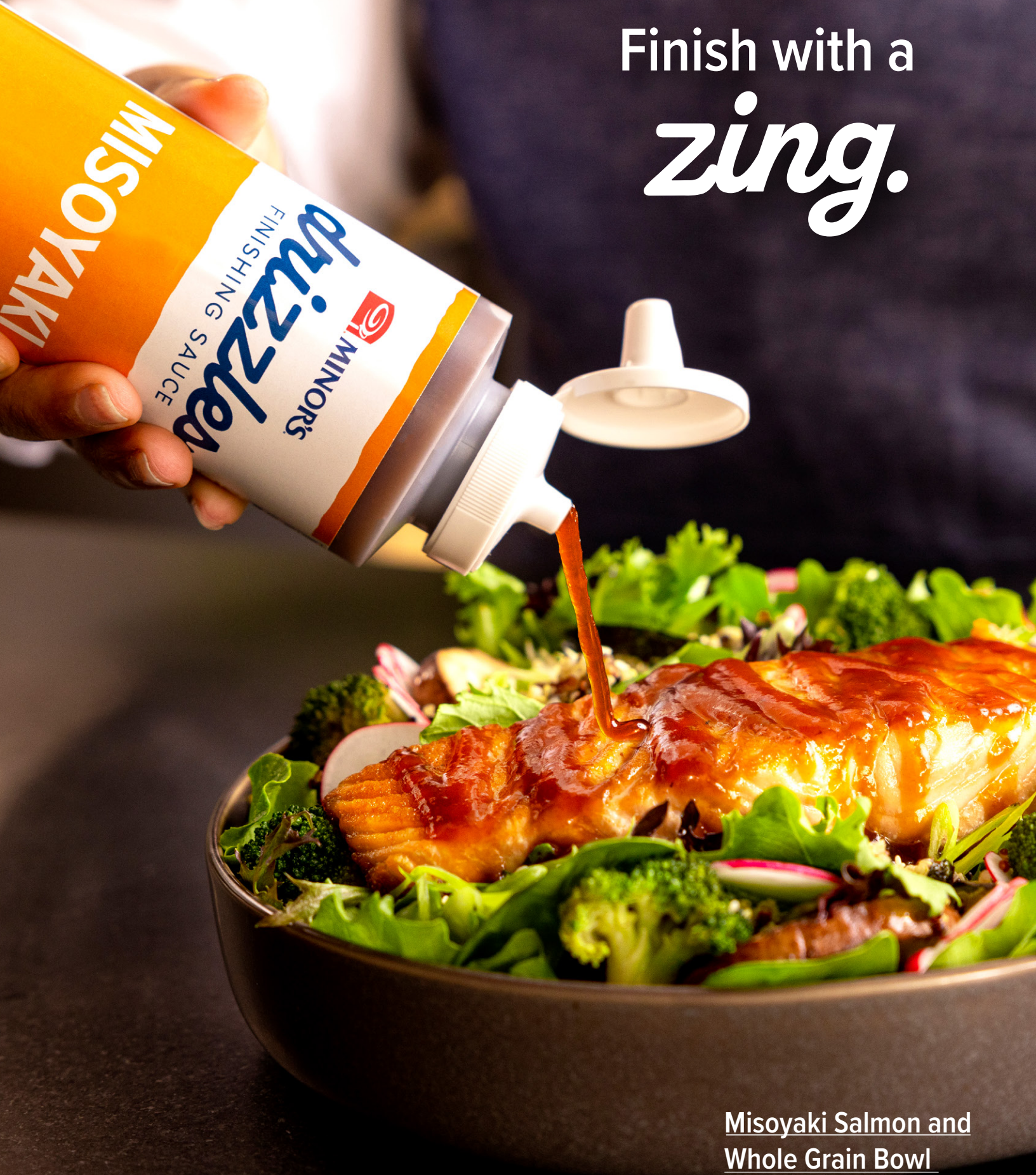
Misoyaki Salmon and Whole Grain Bowl